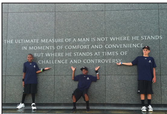
Martin Luther King, Jr. Memorial in Washington, D.C.